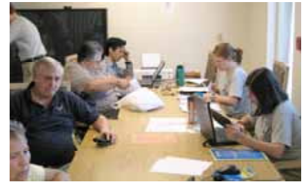
Tax preparation done right—it's serious business!