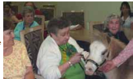
Miniature Horses visit St. Luke's residents

Your support matters to us! With your help, we provide a sanctuary for seniors with limited incomes and the need for a little help in their daily life. St. Luke's provides a caring environment where residents live with independence and dignity. The difference in the modest amount residents pay for room and board and the actual operating