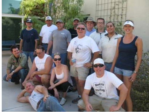
Members of the Southern Arizona Home Builders Association give up a Saturday to rebuild ramadas.

Your continued support makes it possible for us to provide a comfortable home, nutritious meals, supervision and social activities for up to 85 senior citizens each year.